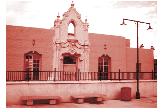
Glendale Transportation Center